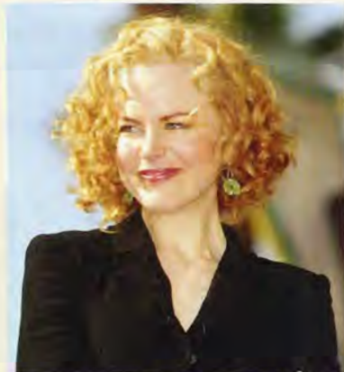
One of the most fascinating actresses of our time

And what does she think of her fame? "It's a fleeting moment," she has said. "How long will it last? Who knows? But it's here and it's now."